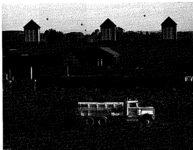
Trucks bring 300 tons of food waste a day to Jepson Prairie Organics; finished compost is applied before vines go in at Bouchaine, in Napa.

(the contaminated liquid gunk that courses through landfills) and methane, a potent greenhouse gas. In fact, landfills are the largest man-made source of methane emissions in the United States. But material that's composted properly emits virtually no methane.